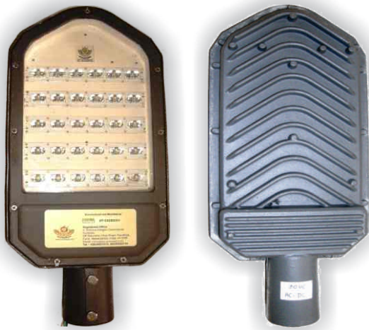
Model No : AV-MSL-30W Model No : AV-MSL-40W

Available with Wide Angle Secondary Optics for Highways